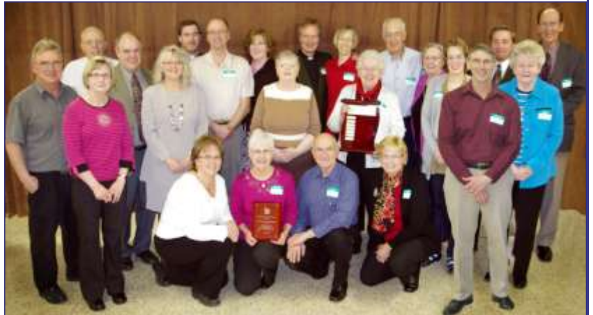
Congregation members of St John's Evangelical Church in Pembroke received a surprise at the LBTC Annual Banquet - a Lifetime Achievement Award. It was presented at both the banquet and the next morning following worship.

The LBTC Board of Directors wanted to acknowledge St John's outstanding contribution to LBTC's mission. So at the Annual Meeting it presented the congregation with the LBTC Lifetime Achievement Award. The Board established this award in 2003 to recognize exemplary service to LBTC, leadership in some phase of the mission of LBTC or significant financial ... Continued on page 6