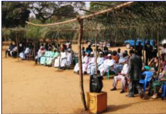
Congregational life centres around God but secular activities are appearing more often today.

This year the annual district Femmes pour Christ meeting was held in Yimbéré. This annual three day