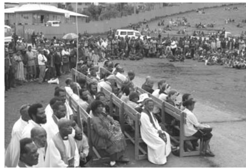
Ipili people attend the dedication of their New Testament in August 2008 - 30 years to complete.

Eternal Treasure continued from page 3 ...