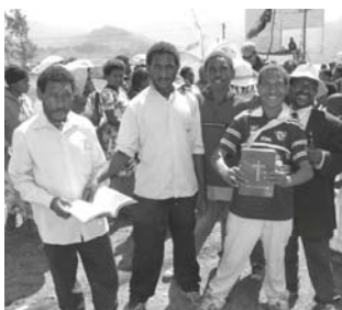
Ipili people purchased their personal New Testaments.

Next, the Borchards are looking into the possibility of translating the Old Testament into Ipili and Enga, the official language of the region.