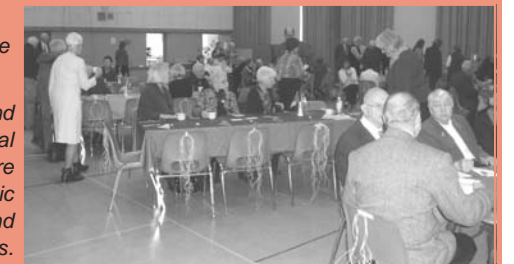
Right: Members and guests enjoyed the meal and African atmosphere created by authentic wooden figurines and other decorations.

Notice to Voting Members - In the mail this month is your ballot for electing three directors for the Board of Lutheran Bible Translators of Canada. Deadline to return your ballot is March 6 2009. If you have not received a ballot, please contact LBTC as soon as possible.